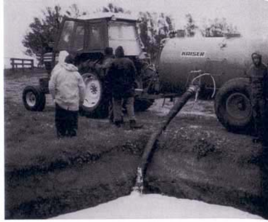
Cowshed effluent being flowed through a Virbela VB500; sucked into a tanker;