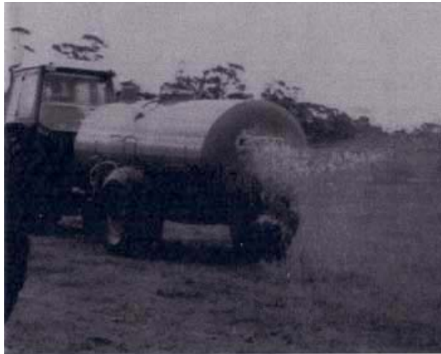
... and sprayed onto pasture. Preparations 502-507 and cowpat pit have been added.